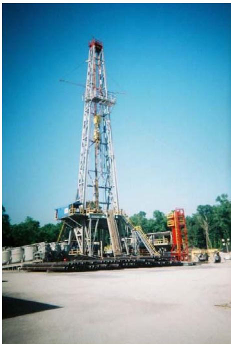
RIG H&P #72 On Location

The Operator has put in place a permanent drilling pad suitable for multiple development wells with excellent access. This will allow for accelerated development drilling and early cash flow in the event of success.